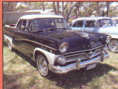
Aussie Mainline V-8