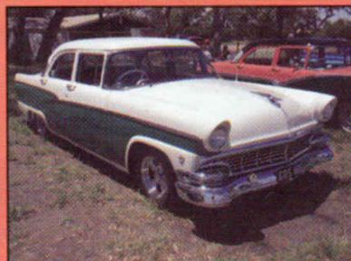
U.S. 1956 Customline

See story on page 4 and more pictures on back cover