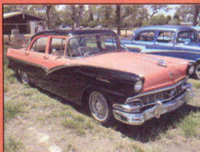
Aussie Black and Coral 1957 Customline