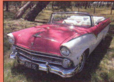
U.S. 1955 Sunliner Tropical Rose & White