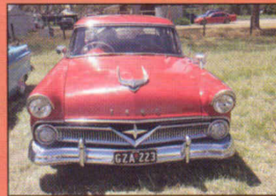
Notice the right side steering wheel on this red Aussie Ford