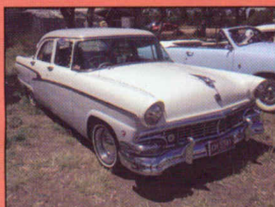
U.S. 1956 Customline