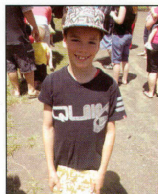
This handsome lad received a gift from Father Christmas.