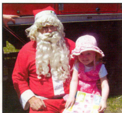
Father Christmas with charming little girl who wants a new doll: "I believe, I believe, I believe."