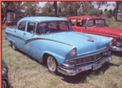
U.S. 1956 Fairlane in blue