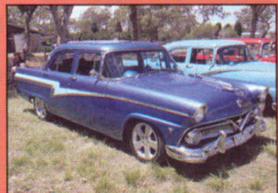
This blue four door sedan is striking with a light blue thunderbolt