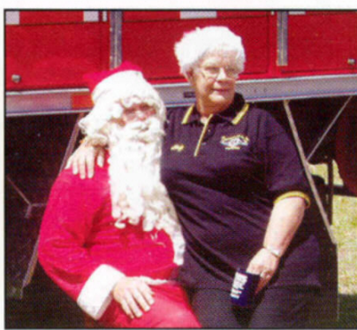
Father Christmas with charming big girl who wants 1956 Sunliner: "I believe, I believe, I believe."