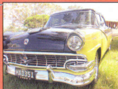
Aussie black and yellow 1957.

See story on page 4 and more pictures on back cover